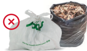
No plastic or biodegradable bags If using a bag to line your kitchen pail, only use certified compostable bags

By keeping these items out of your green cart, you're doing your part to ensure we can produce the highest quality compost possible that will be used at local farms, gardens and in your community.