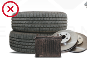
No automobile waste (including car parts, tires and batteries)