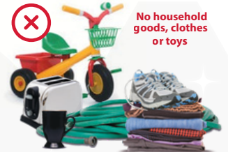
No household goods, clothes or toys