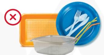
No foam, plastic packaging, plates or cutlery (even if they say compostable)