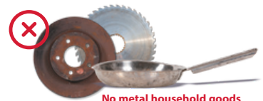
No metal household goods

No household hazardous waste If an item has a hazard symbol, then it must be taken to a Household Hazardous Waste Drop-off, even if it's empty.