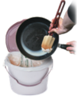
Cooking oil, sauces and grease

Tip: Use a paper towel to soak up any fats, oils or grease and put it in your green cart too.