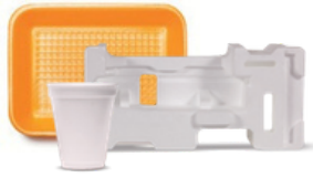
Foam containers or foam packaging Even if it has a recycling symbol.