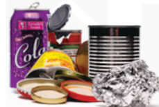
Containers made of tin - Food cans and tin foil