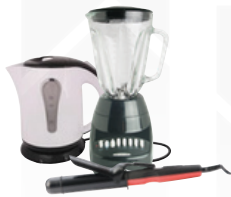
Small broken appliances