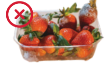
No food in packaging Separate food scraps from container before composting