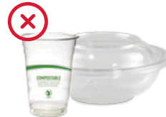
No compostable plastic packaging or containers