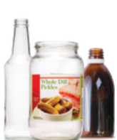
Containers made of glass - Food jars and bottles

Containers such as jugs, bottles, cartons, cans and other rigid containers.