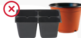
No plant pots or bedding trays Separate plants and soil from container before composting.