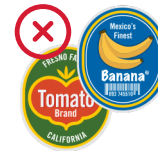
No fruit or vegetable stickers