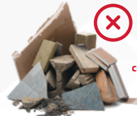
No large quantities of construction or building materials