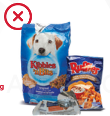
No mixed packaging