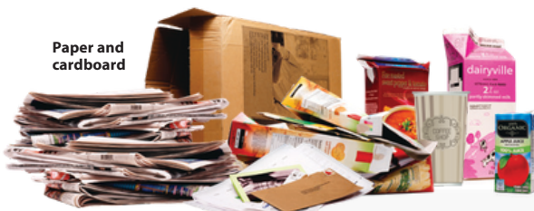
Paper and cardboard

See special instructions below for items such as shredded paper and bundled plastic bags .