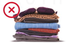
No clothing, pillows or fabrics

Organic / Compost material and or bags left outside the bin will NOT be collected