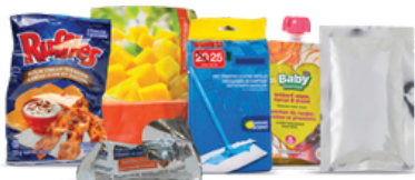
Mixed packaging and non-stretchy bags Even if it has a recycling symbol.

After reusing, composting and recycling, you will easily cut your garbage in half. Only items that have reached the end of their useful life should go in the garbage.