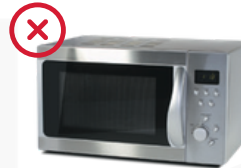
No large electronics or appliances