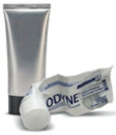
Lotion and toothpaste tubes