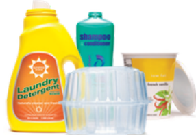
Containers made of plastic Labeled with recycling symbols 1-7.