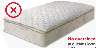
No oversized items (e.g. items longer than 1.25 metres or heavier than 20 kilograms).

If an item has a hazard symbol, then it must be taken to a Household Hazardous Waste Drop-off, even if it's empty. Find locations at calgary.ca/hhw