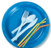
Plastic plates, cutlery and straws