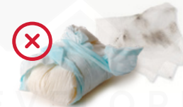
No diapers or wipes (even if they say compostable)