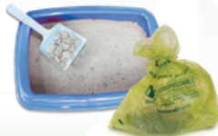
Pet waste and kitty litter (all varieties)

Put in a certified compostable bag or paper bag and tie/roll closed.