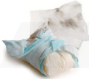
Used diapers and wipes