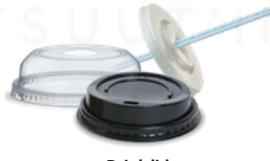
Drink lids Even if it has a recycling symbol.